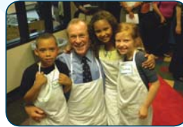
Governor Ted Kulongoski with his Fresh Choices team, The Sizzlers