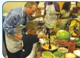
Gov. Kulongoski and team choosing fresh ingredients for their quesadillas

The Blazers Club hosted a Fresh Choices Challenge in honor of the state-wide launch of a major transformation of the Women, Infants and Children (WIC) nutrition program.